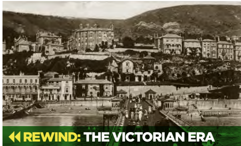
◀◀ REWIND: THE VICTORIAN ERA