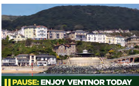
|| PAUSE: ENJOY VENTNOR TODAY